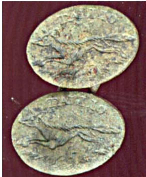
Figure 6: "Running Fox" cuff links, from a root cellar dating to the 1820's to 1840's.