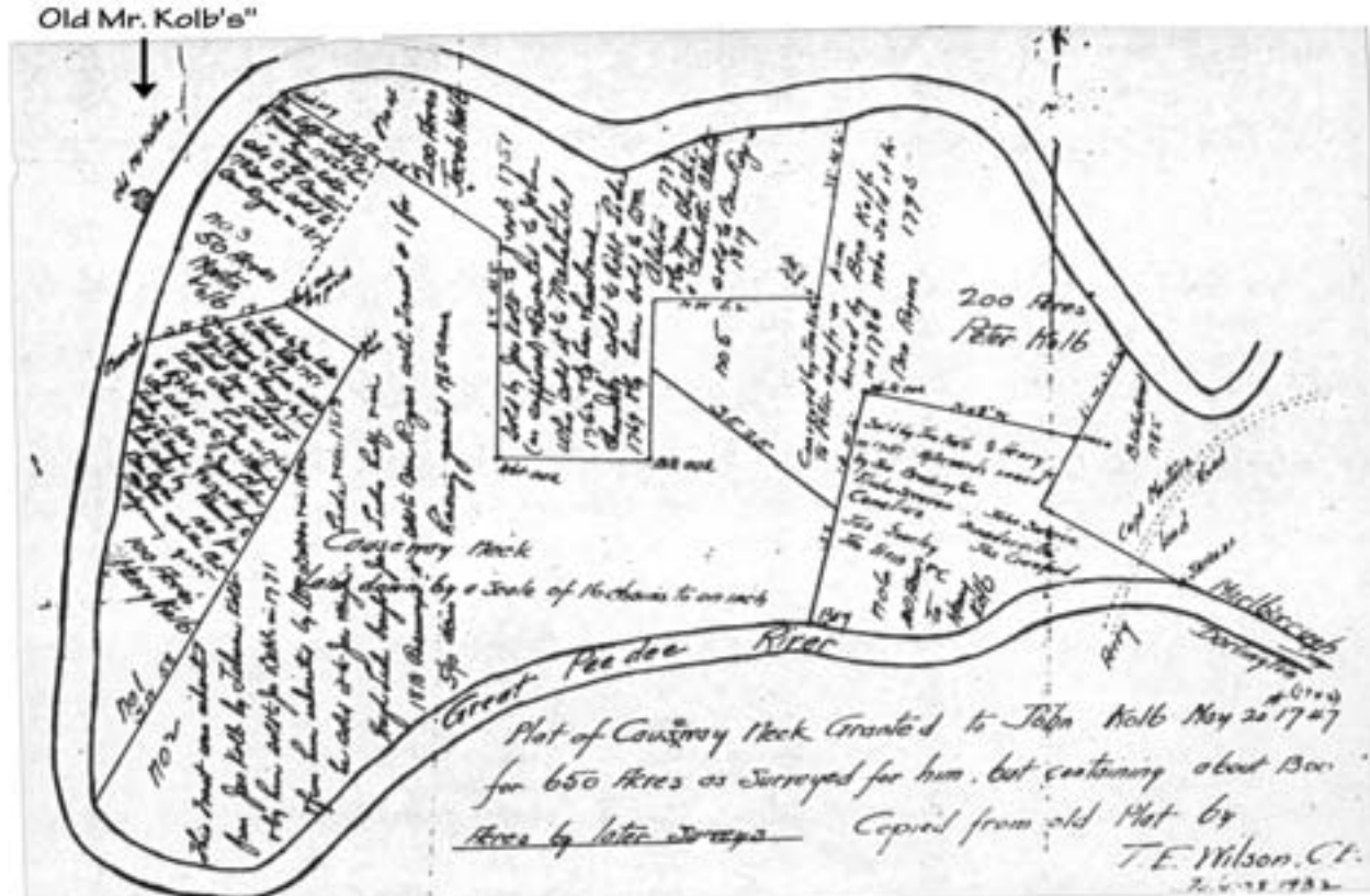
Figure 3: T. E. Wilson's reconstruction of Cashua Neck land ownership.