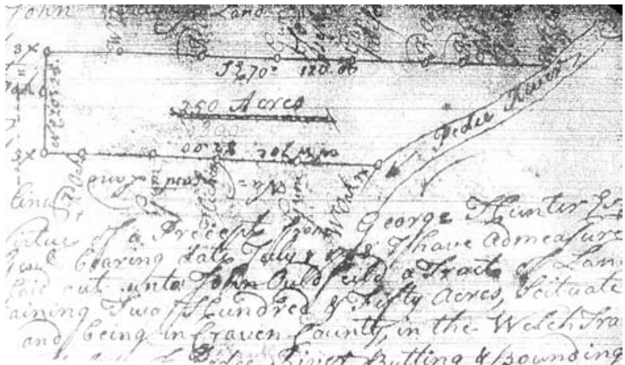
Figure 4: The 1751 plat that accompanied John Ouldfield's Will.